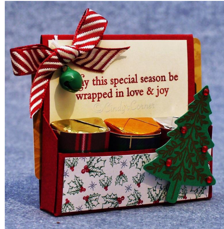
Inspired by Gloria Plunkett